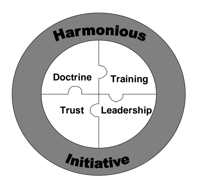
Figure 1Four Element Model of Harmonious Initiative.

These four synergistic elements form an environment that supports harmonious initiative and hence an agile team. Using this model, we will describe each element and then compare that element to relevant Agile Principles and practices.